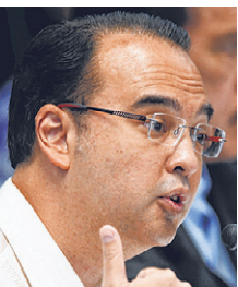
Alan Peter Cayetano