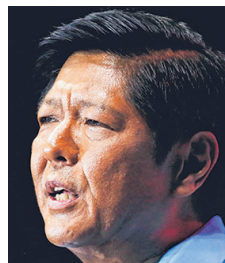
Ferdinand Marcos Jr.