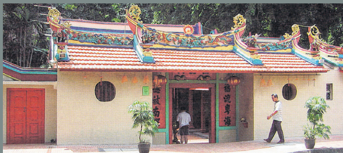
Fook Tet Soo Hakka temple