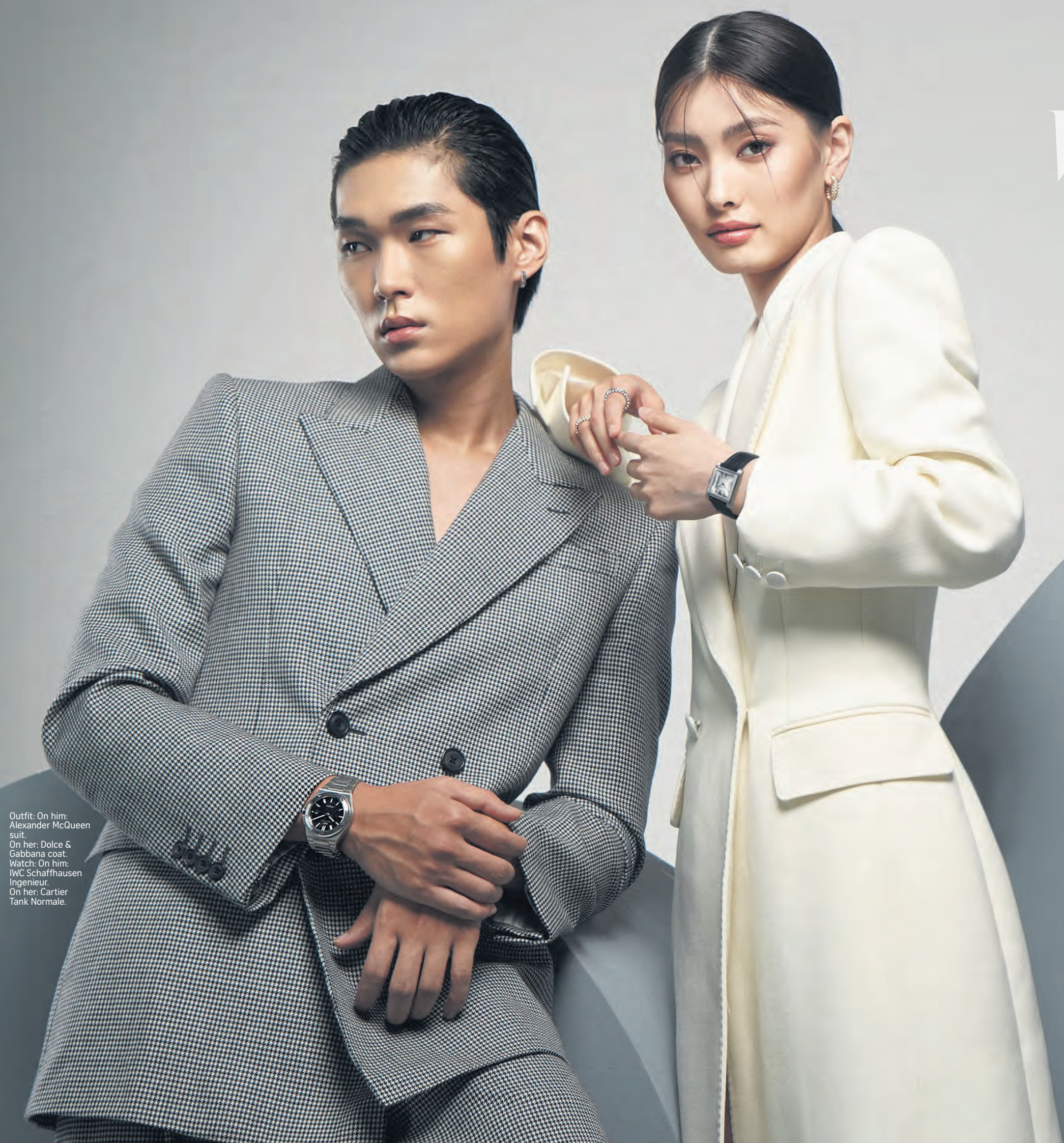
Outfit: On him: Alexander McQueen suit. On her: Dolce & Gabbana coat. Watch: On him: IWC Schaffhausen Ingenieur. On her: Cartier Tank Normale.

From ground-breaking sports models to whimsical complications, popular classics resurface with renewed vigour