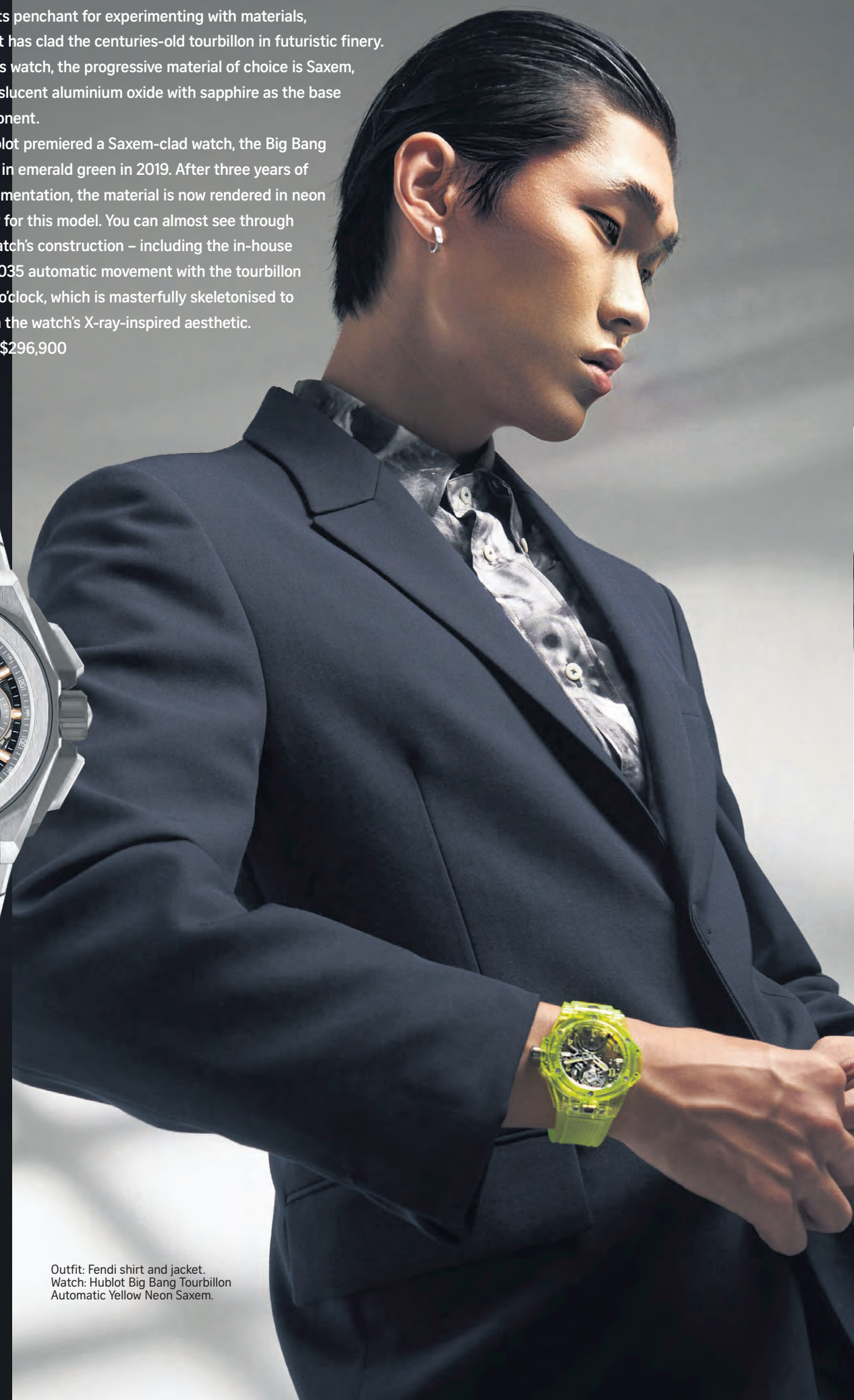
Outfit: Fendi shirt and jacket. Watch: Hublot Big Bang Tourbillon Automatic Yellow Neon Saxem.