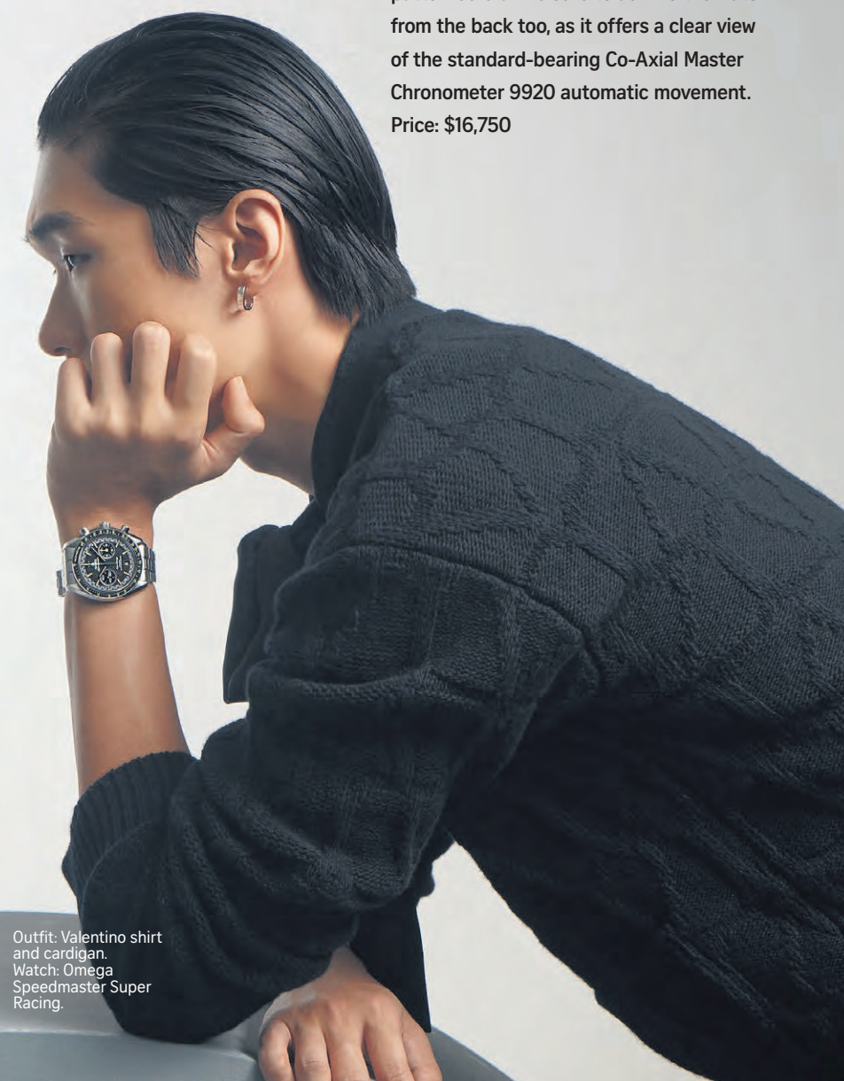
Outfit: Valentino shirt and cardigan. Watch: Omega Speedmaster Super Racing.