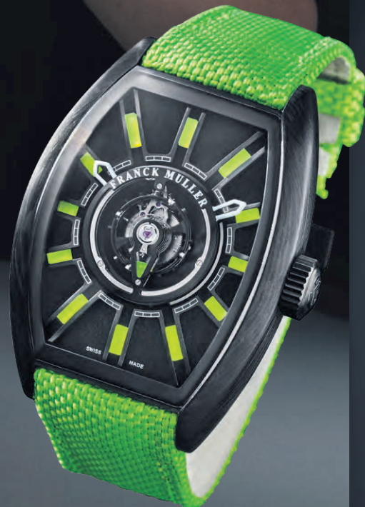
Outfit: Valentino shirt and cardigan. Watch: Franck Muller Grand Central Tourbillon Flash CX36.