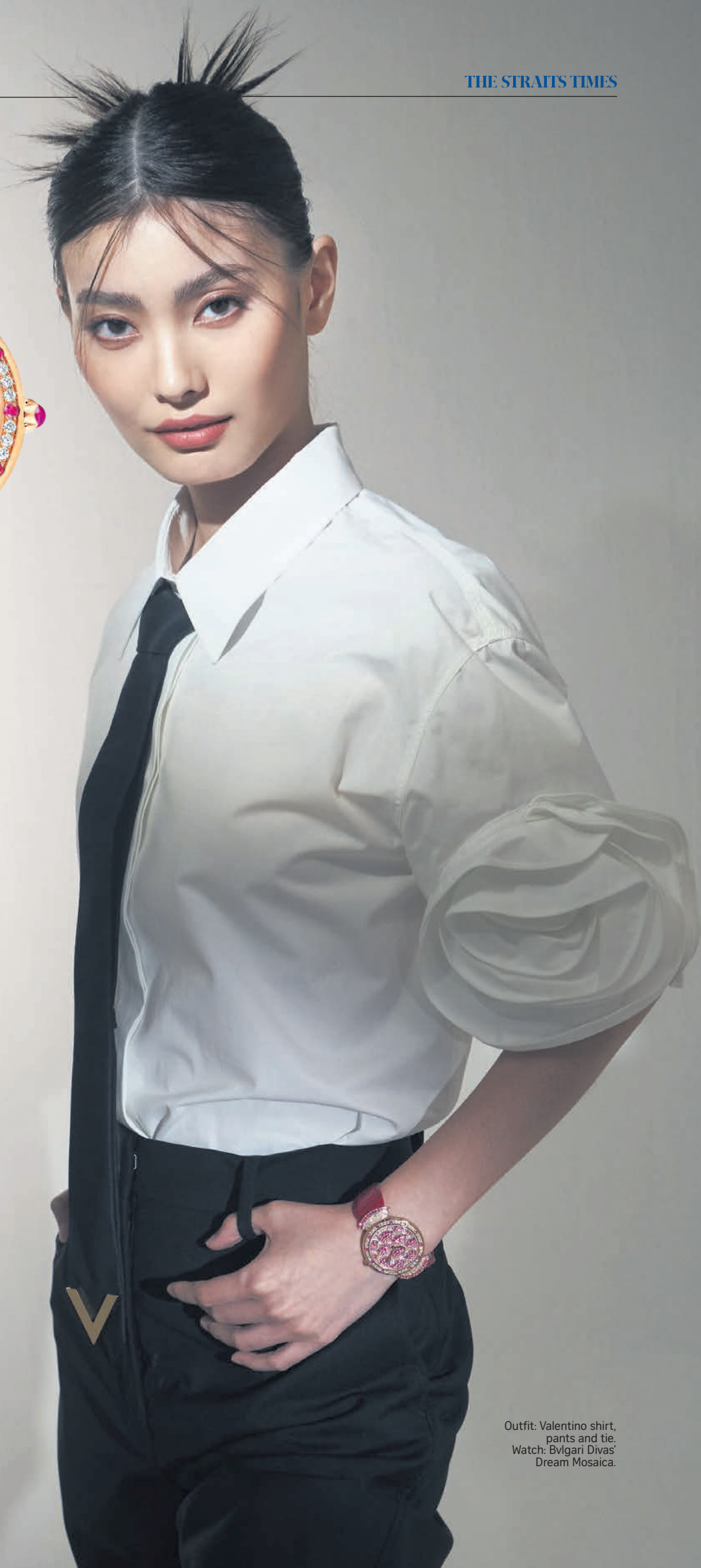
Outfit: Valentino shirt, pants and tie. Watch: BVLGARI Divas' Dream Mosaica.

Set with 52 baguette-cut diamonds on the bezel, the Slim d'Hermes' white gold case frames a dial adorned with a dynamic motif of a galloping horse. This equestrian depiction is one of two timepieces that feature the magnificent beast in gold dots on silk. To create the studded horse, the artisan uses a laser to carve miniscule cavities into the white gold surface that has been enamelled and polished by hand. The 1,678 pink gold beads are then individually placed in the cavities, before they are fired in the oven to set them in the enamel. Driving the 39.5mm timepiece, which is limited to 24 pieces, is the ultra-thin Hermes H1950 self-winding movement. Price upon request.