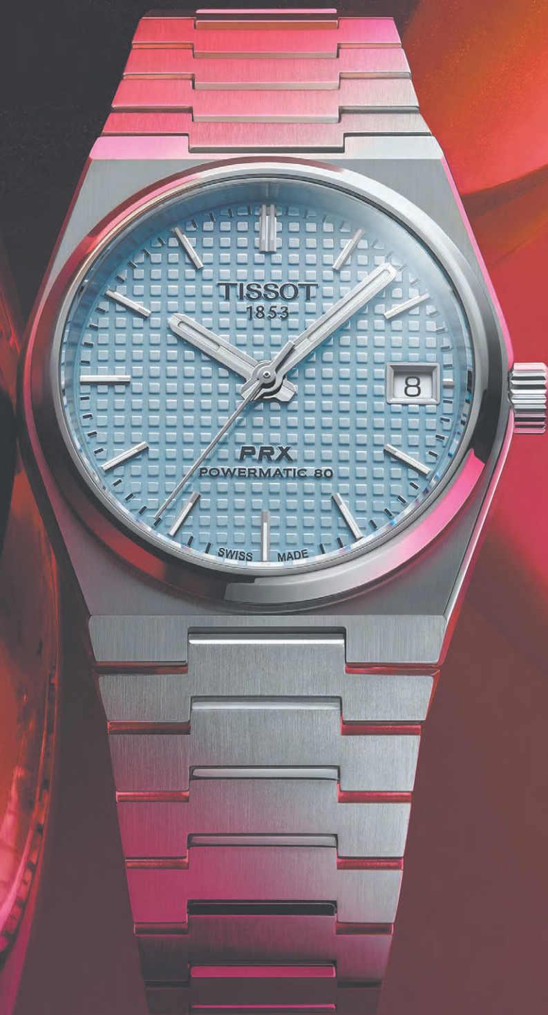
TISSOT PRX 35 MM AUTOMATIC