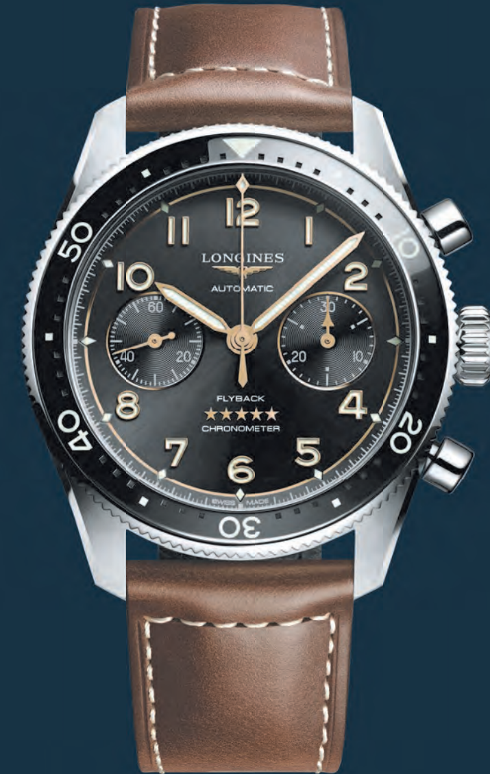
LONGINES SPIRIT FLYBACK

Outfit: Gucci shirt and jacket. Watch: Gucci G-Timeless Planetarium.