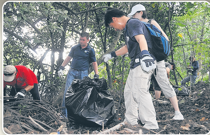
First-time volunteers helping to clean up Pandan Mangrove in September. In all, 3,448 pieces of trash were found and removed along 350m of shoreline during the operation organised by International Coastal Cleanup Singapore.