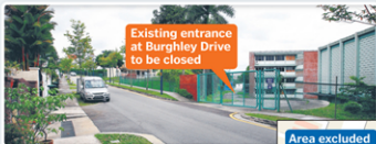
Existing entrance at Burghley Drive to be closed