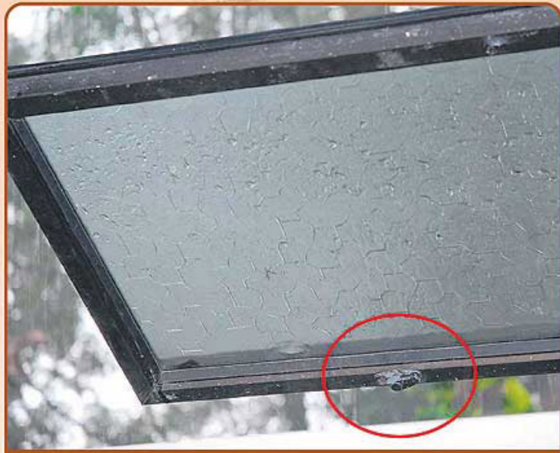
The window has two panels. Grilles were to have been installed but weren't because of a misunderstanding between the ISD and the vendor. When this was discovered, the centre's superintendent asked that the handle of the window be sawn off.

» Mas Selamat enters the toilet next to the visiting room to freshen up. Guard One stands outside the toilet door. Guard Two follows him into the toilet. » After shaving and combing his hair, Mas Selamat goes into a urinal cubicle and shuts the door. He flips his pants over the door. » Guard Two hears running water from a tap. Thinking that Mas Selamat has taken too long, Guard Two alerts Guard One. » Both report to the female ISD officer waiting outside the toilet. In turn, she asks Mas Selamat's assistant case officer to check on the detainee.